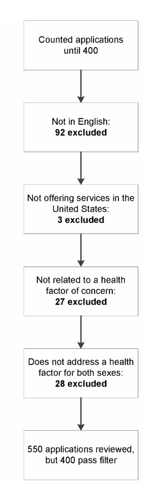
Figure 1. Assessment flowchart.

Figure 2 shows the number of apps that addressed each health factor. Among the 400 apps in the final cohort, fitness/training was the most popular health factor, accounting for 174 out of 400 apps surveyed (43.5%). These apps consisted mostly of predesigned exercise plans or a collection of exercises for the user to follow. The next two most common categories were health resource (ie, providing information about a health resource such as a gym, doctor's office, or health plan) and diet/caloric intake, accounting for 60 out of 400 apps (15.0%), and 57 out of 400 (14.3%) apps surveyed, respectively. The diet/caloric intake apps most commonly allowed users to track calories consumed and expended. All of the calorie apps had a preexisting database of calorie information, but allowed users to create their own items.