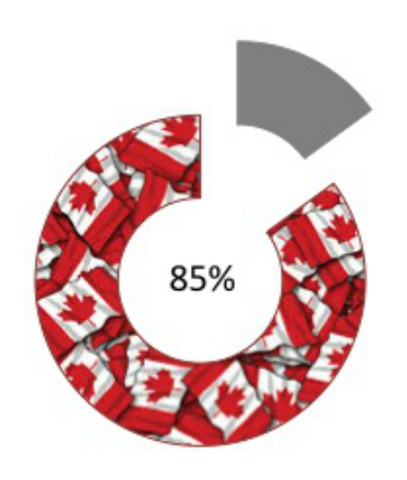
Figure 1. Physical inactivity burden in North America. 85% of Canadian adults and 97% of American adults fail to meet public health guidelines for physical activity.

including primary and secondary prevention of chronic and non-communicable diseases [4]. Physically inactive lifestyles are the fourth leading cause of death, and globally contribute to more than 3 million deaths per year [5]. In North America, the majority of adults in the United States and Canada are not meeting minimum public health recommendations for physical activity [6,7]. Engaging in unhealthy physical activity behaviors, such as a physically inactive lifestyle, has substantial negative consequences for public health including the economic burden for society [5] (see Figure 1).