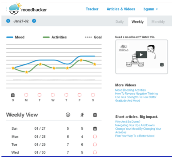
Figure 4. MoodHacker weekly mood and activity graph page.