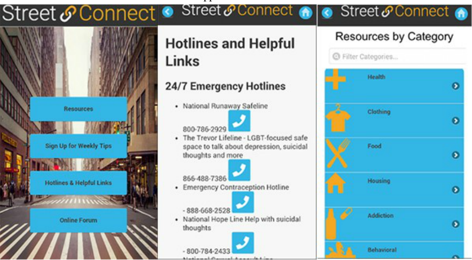
Figure 3. YTH StreetConnect and YTH StreetConnect PRO final apps.

participants, YTH StreetConnect also provides confidential access to sexual health services, a resource that H/UH youth are more likely to use if they can access it confidentially [17]. The new online referral function for providers may also help retain H/UH youth in long-term care.