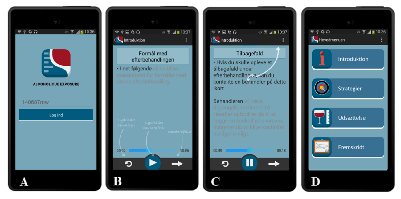
Figure 2. Log-in page (part A), introduction (part B and C), and main menu (part D).