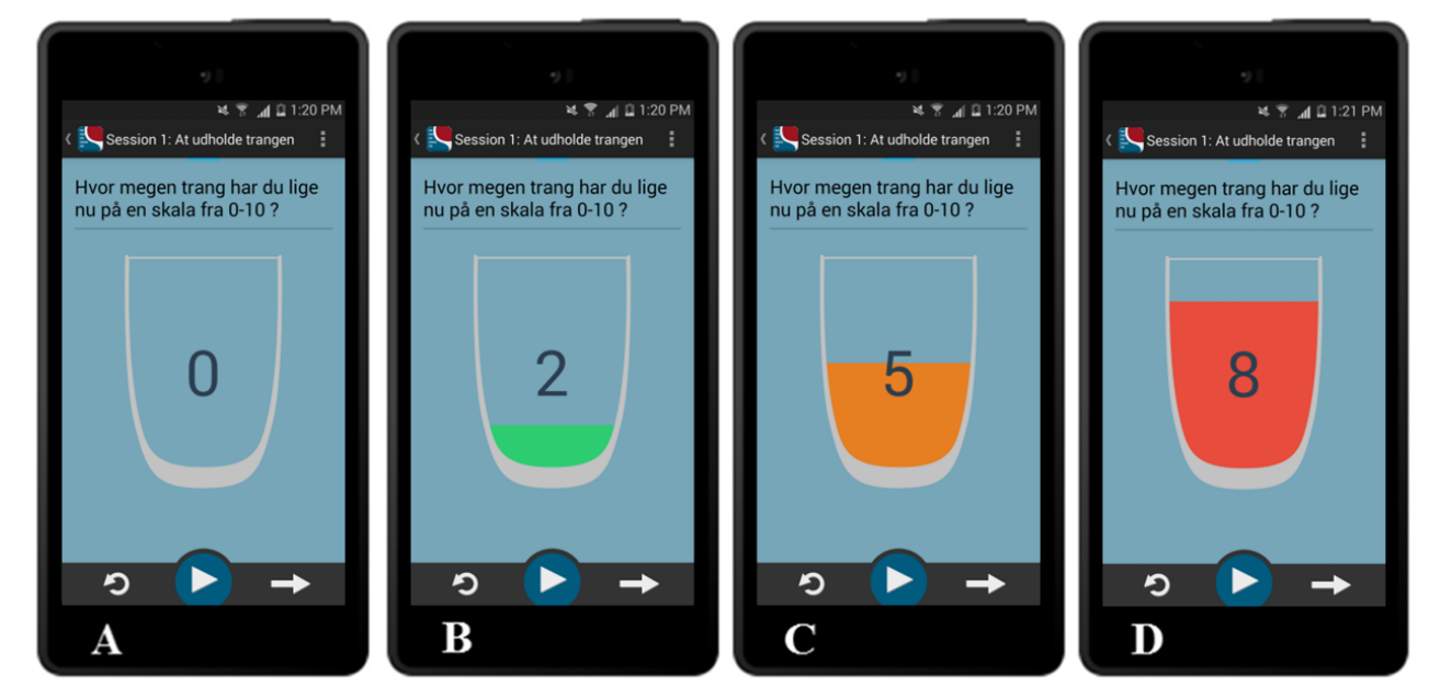
Figure 5. Real-time measures of cue-induced cravings.