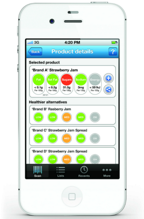
Figure 4. Crowdsourcing function in FoodSwitch.