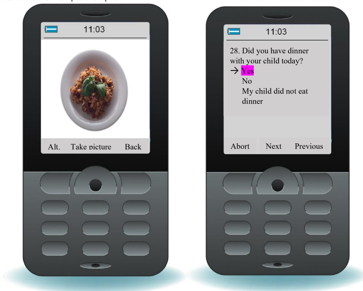
Figure 1. Screenshot of a TECH question and picture.