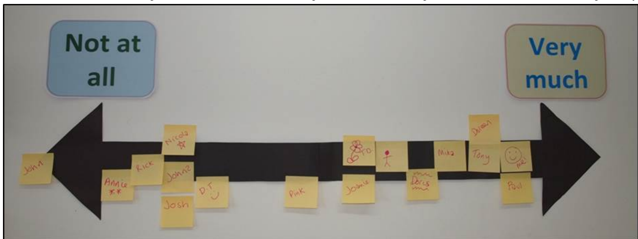
Figure 4. Visualization of adult and parent satisfaction with the titration period. (Note: this is a representation of data and all names are pseudonyms).

HCPs across all groups raised concerns about the validity and reliability of ROMs, such as whether they are sensitive enough to detect subtle effects. ROMs were also believed to become less informative with repetitive use, open to manipulation, and difficult to interpret when responses differed between respondents (eg, parents, teachers).