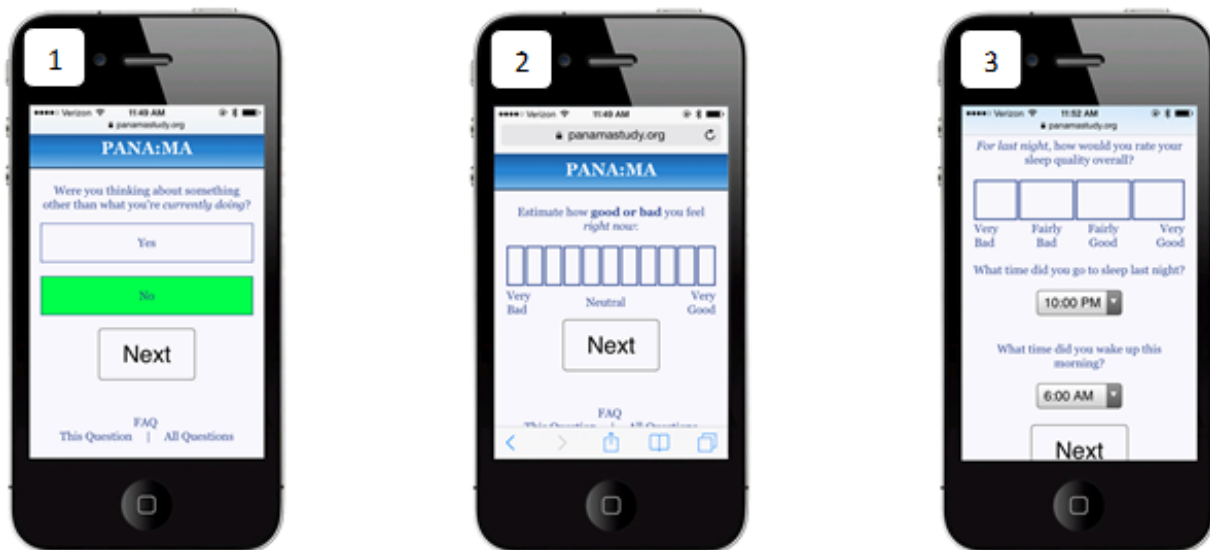
Figure 1. Panel 1 demonstrates the survey item assessing mind wandering; panel 2 demonstrates the survey item assessing affect; and panel 3 demonstrates the survey item assessing sleep.

Mind wandering was assessed each hour using an item adapted from Killingsworth and Gilbert [1]. This item asked, "Were you thinking about something other than what you were currently doing?" Response options were "yes" and "no" (see Figure 1, panel 1).