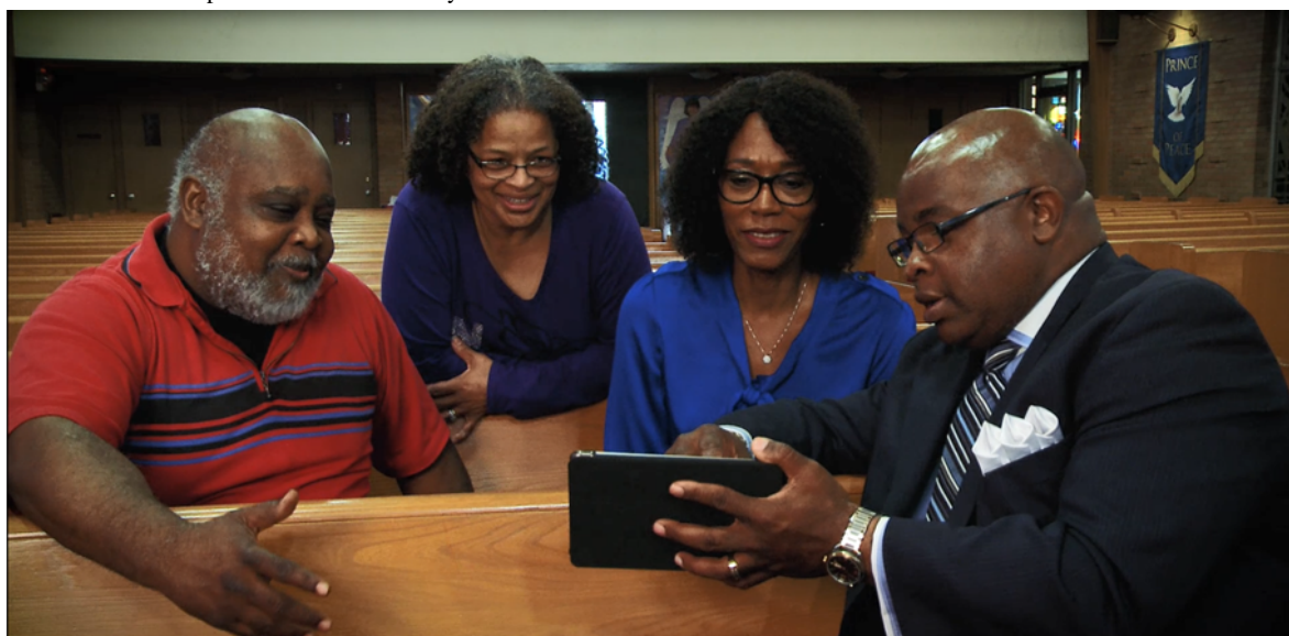
Figure 1. Community members interacting with a community-based mobile health intervention, the FAITH! (Fostering African-American Improvement in Total Health) App . Researchers and African American churches partnered to codevelop the FAITH! App to promote cardiovascular health within faith communities.

Further integration of evidence-based behavioral change theoretical frameworks into the app features resulted in a culturally aligned intervention that positively impacted the cardiovascular health of the study participants (blood pressure, diet, and physical activity; all P values < .04 ) [32]. See Figure 2 for images of the app homepage and sample education module.