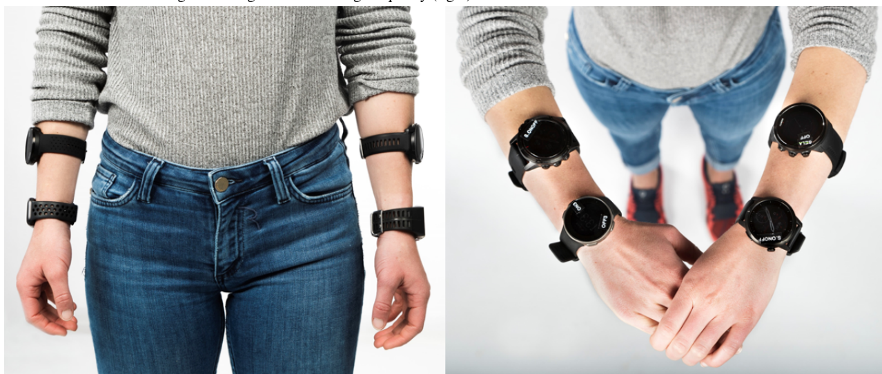
Figure 2. Randomly assigned wearing position on the forearm of the sport watches during one measurement (left). Calibration posture with arms outstretched to achieve the best global navigation satellite signal quality (right).