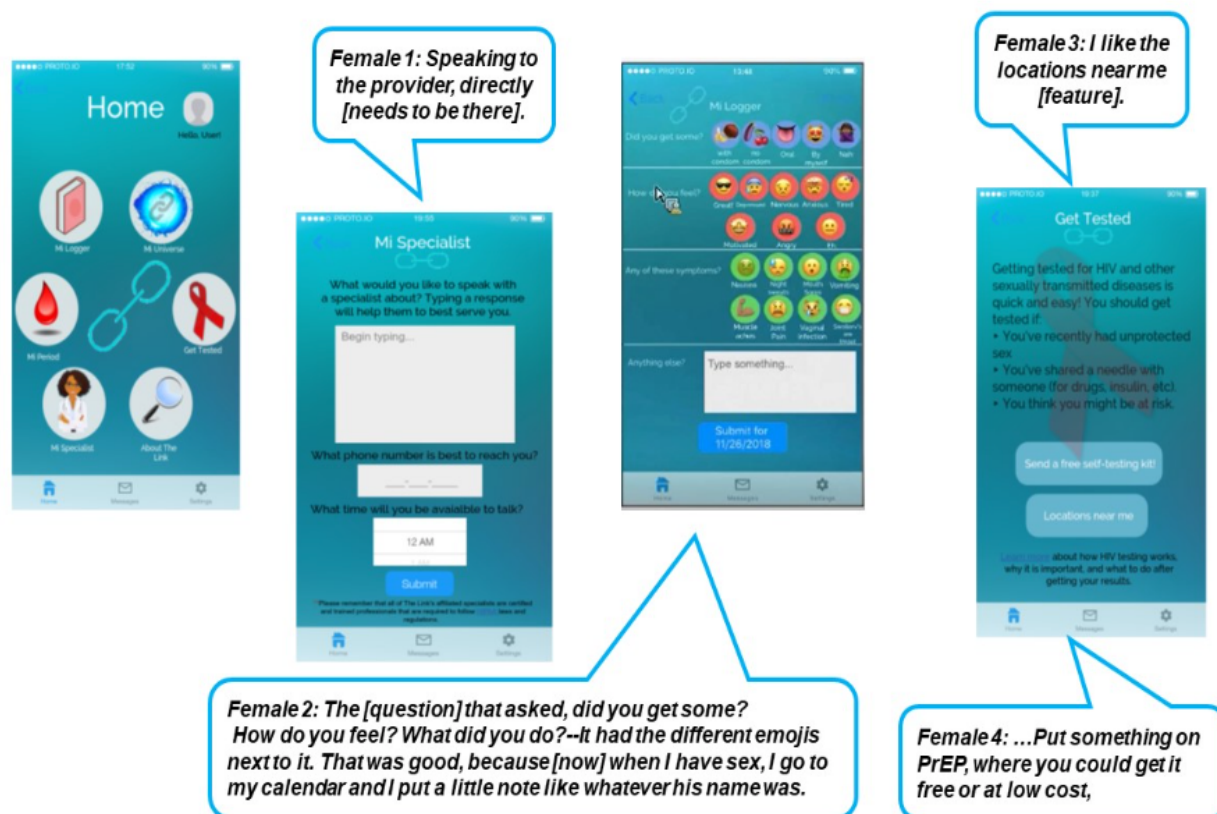
Figure 2. Sample mobile app prototype features and pages. PrEP: pre-exposure prophylaxis.

I feel like even the health tracker thing on your iPhone tells you to put in your weight and your height. I know my BMI is 39, but I also know I'm active as heck. So, yes, you can tell me this but my lifestyle says something different. I feel like I would expect a health app to ask me that. I feel like that would be part of the sign-in process. But I guess I'd maybe give the option to skip [the risk assessment]. [Focus group #3 participant]