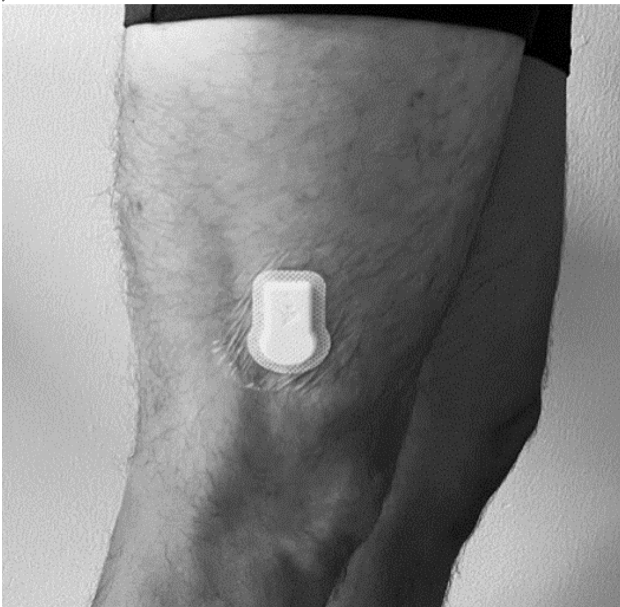
Figure 1. The photograph demonstrates the SENS Motion physical activity tracker at the lateral side of the distal thigh of 1 of the participants in the study.

The SENS Motion algorithm calculates the number of steps taken during sporadic and continuous walking, as well as training, in three different categories: